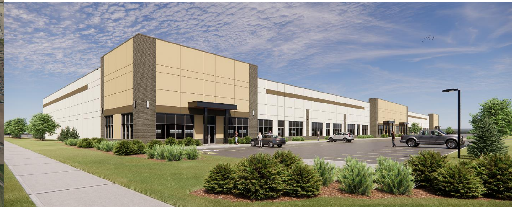
SOUTH EDMONTON'S NEWEST PREMIER INDUSTRIAL FACILITY