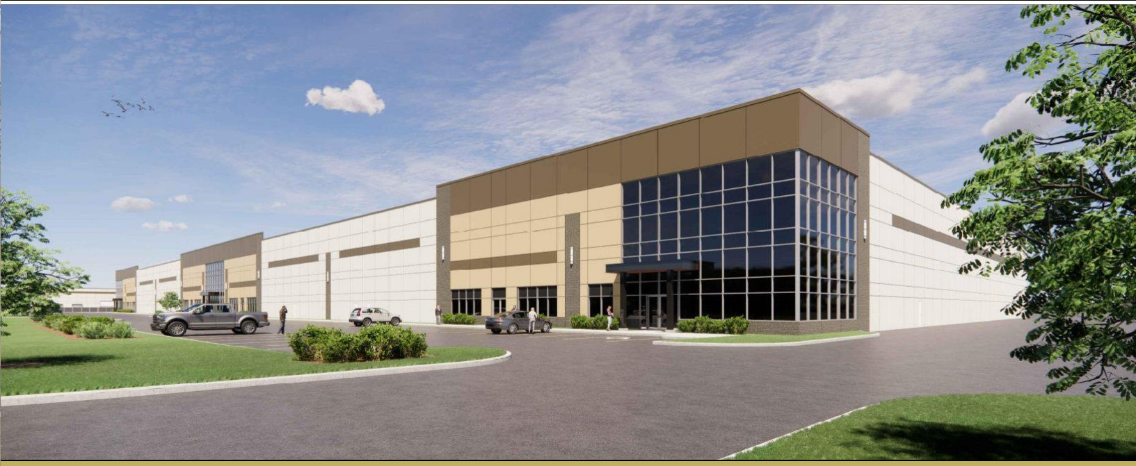
SOUTH EDMONTON'S NEWEST PREMIER DISTRIBUTION CENTRE